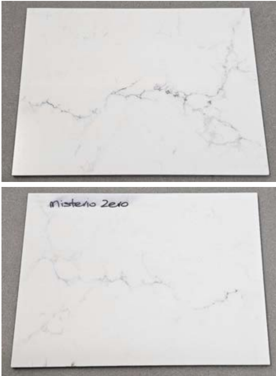
Image 1: Appearance of sample as received from client (front surface – top, back surface – bottom).